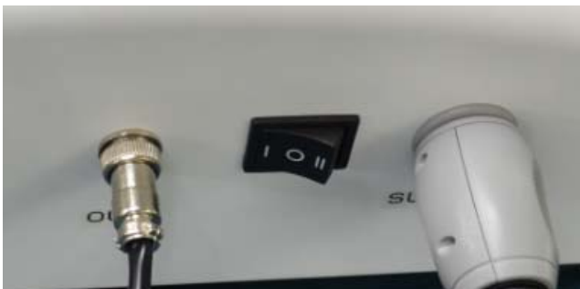
Use Suction RF Probe