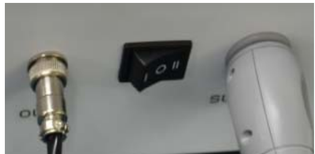
Use Normal RF Probe